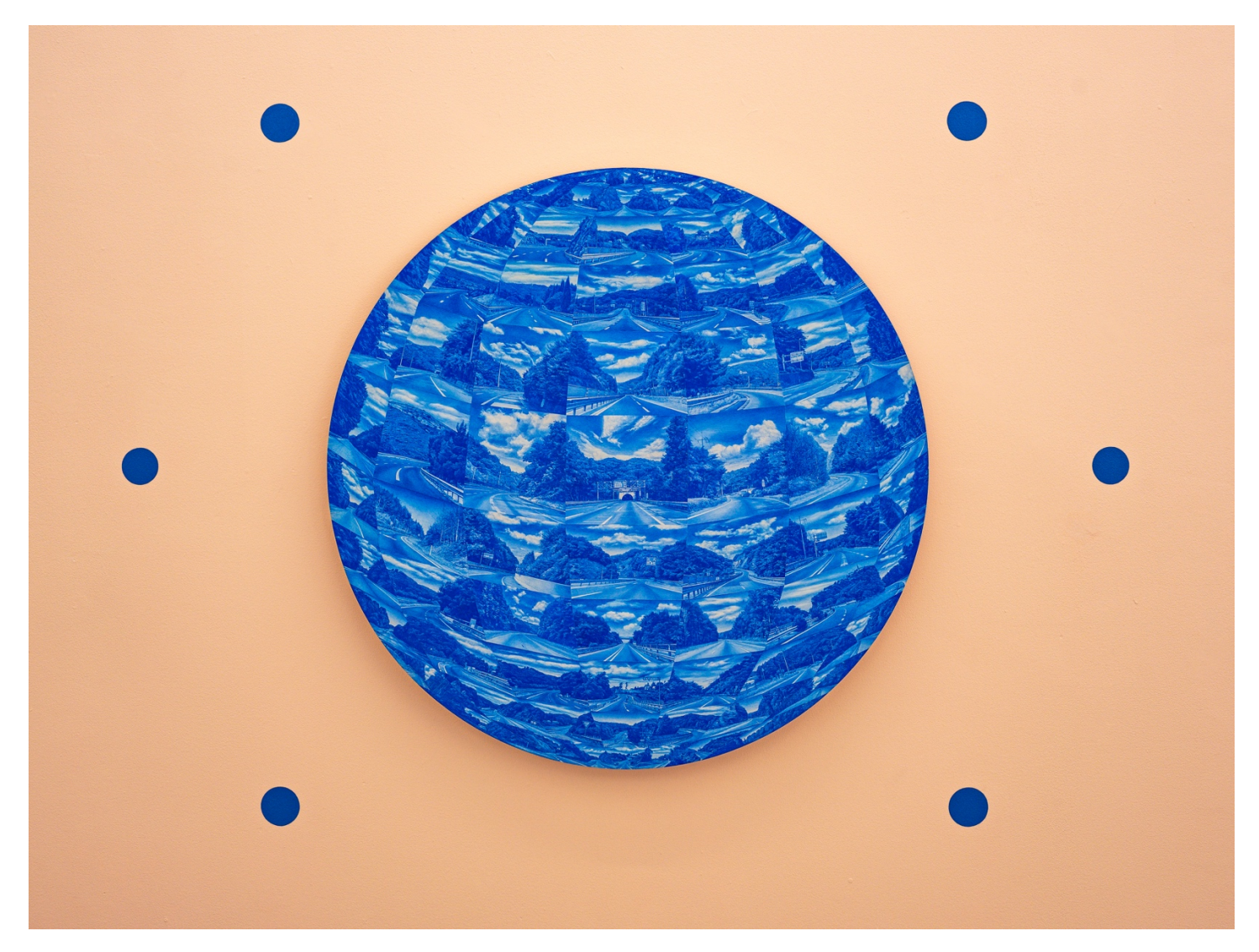
New Worlds (Faceted Circle) , gouache and acrylic on panel, 50" diameter x 2" depth + variable dimensions for painted dots, 2023