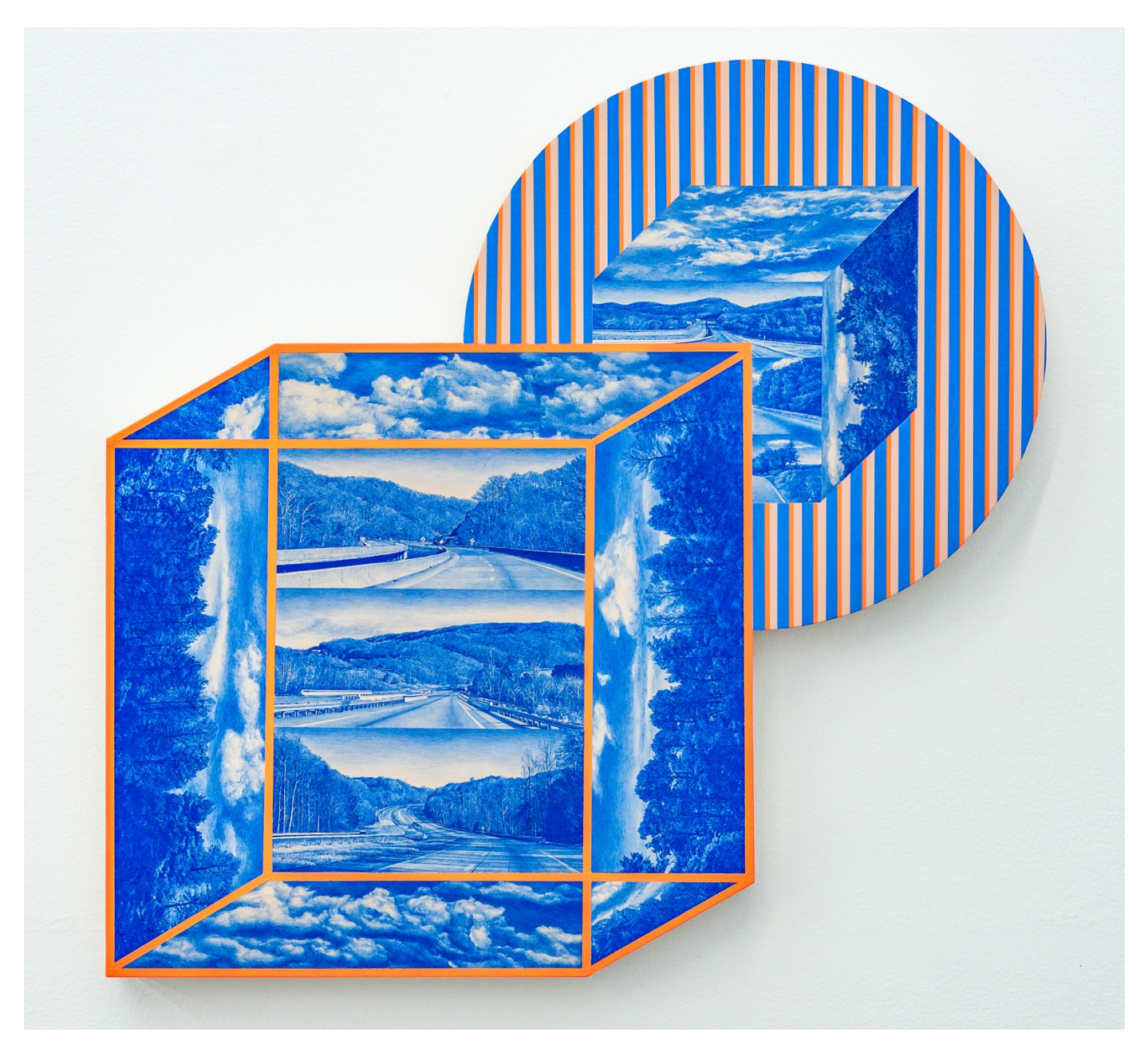
New Worlds (Cube and circle), acrylic and gouache on panel, 30"x 28"x 2", 2023