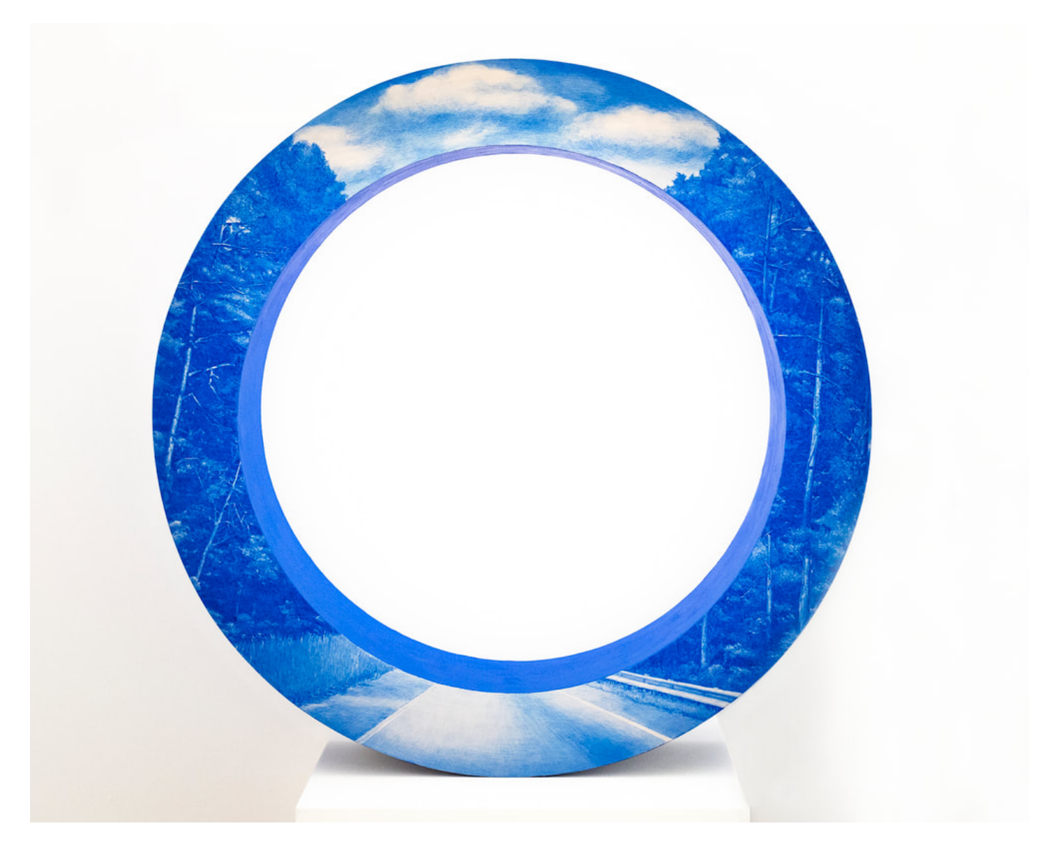
Shape of Distance (Wheel), gouache & acrylic on shaped panel, 25" diameter x 6"x 3", 2022